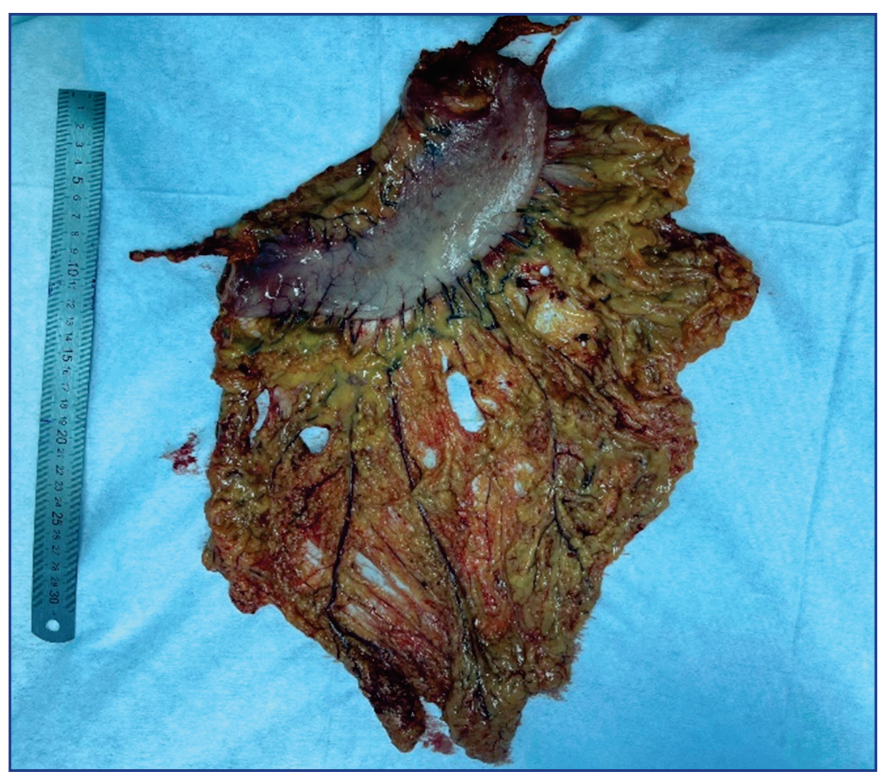
Figure 1 – Resected stomach specimen

Results: The first part of the simultaneous surgery involved the Bentall-de Bono procedure, for which the thoracic cavity was opened by sternotomy. Then, after cannulation of the aorta, superior vena cava, inferior vena cava, and right superior pulmonary vein, the cardiopulmonary bypass (CPB) machine was connected. The aortic root, aortic valve, and ascending portion of the aorta were replaced with a valve containing conduit SJM Epic Valve #27 with initially formed vascular prosthesis Polythese #30. Esophageal echocardiography showed a normally functioning aortic valve. The total time of CPB was 114 minutes, after which the patient was returned to normal circulation without any complications. Protamine sulfate was used as a heparin antagonist. After the closure of the sternotomy, the second part of the simultaneous surgery took place, where a team of surgical oncologists performed midline laparotomy. Upon exploration of the abdominal cavity, no signs of distant metastasis or locally advanced tumor were seen. The cancer of the stomach was palpable along the lesser curvature in the body of the stomach with an approximate size of 15x20x20 mm with invasion of serosa. Total gastrectomy with D2 lymph node dissection was performed with end-to-side esophagojejunostomy (Figure 1). In addition, side-to-side jejune-jejunal anastomosis and feeding jejunostomy was done.