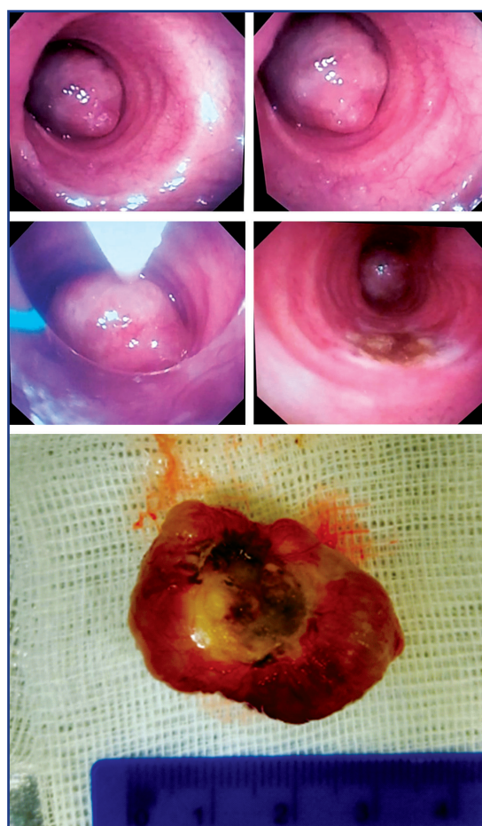
Figure 2 – Images of the tracheal tumor

tained after coagulation, without signs of wall damage. The patient was extubated with simultaneous tumor extraction from the tracheal lumen. Then the patient was re-intubated under endoscopic control using a bronchoscope and transferred to the recovery room, where he was extubated after 15 minutes and transferred to the clinical department. The patient's anesthetic benefit consisted of deep sedation with propofol 600 mg, short-term muscle relaxation, and oxygen support (Figure 2).